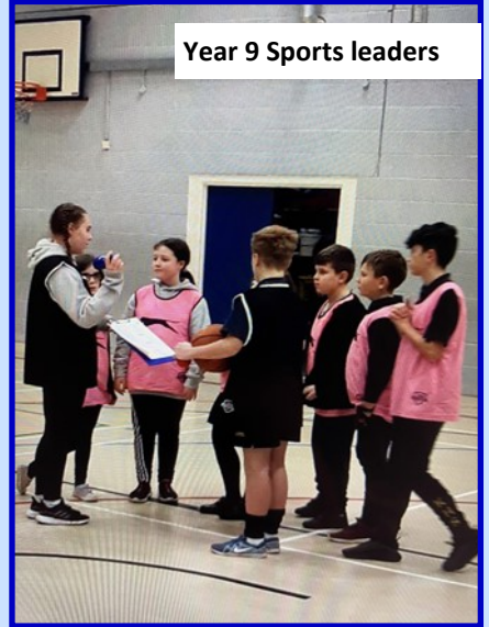
Year 9 Sports leaders

fixtures and rules to designing certificates and awards. They had the chance to lead an "Endzone" tournament to students from Kingstone Primary and it was a huge success, well done to everyone involved, I know the students down the primary are looking forward to next term's tournament.