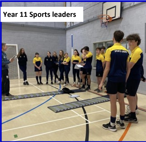
Year 11 Sports leaders

This half term our leaders have developed their skills across several opportunities. Most notably, our Year 11 leaders welcomed 3 local primary schools for some Indoor Athletics, as a warm up event, to the main competition in January when 8 schools will be competing for the title of County Champions!