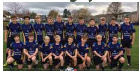
The boys are looking smart in their new kit courtesy of sponsors Beyond Storage