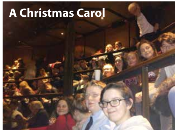
Royal Shakespeare Company, Stratford-upon-Avon