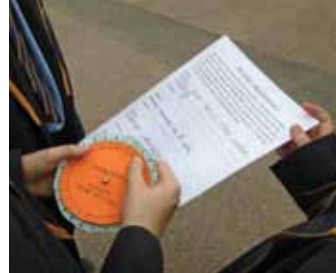
Upon return the maths department ran a series of lessons connected to Bletchley Park, finishing with a Spy Hunt around the school. We saw a lot of excited pupils running around the school grounds.