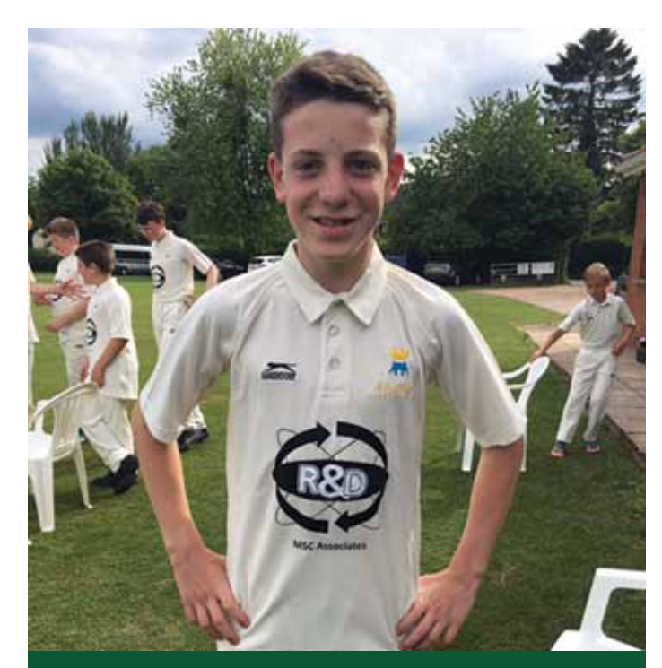
Our new Cricket Whites for our 1st XI are kindly sponsored by R&D MSC Associates of Rotherwas